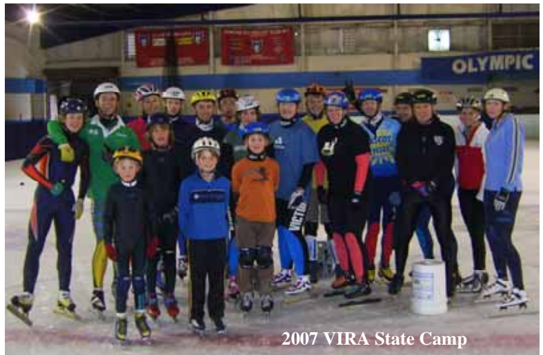
2007 VIRA State Camp